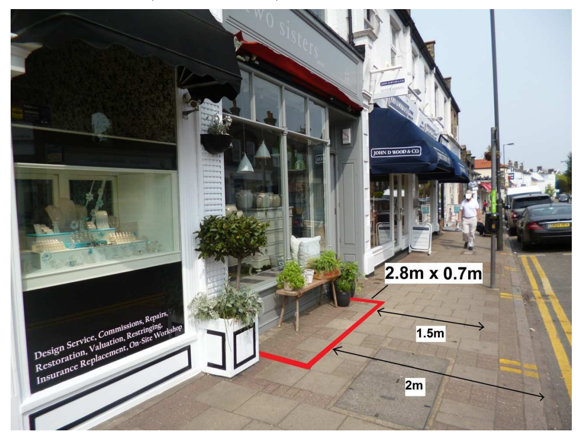
Appendix B Two Sisters Home, 3 Church Road, Wimbledon.

representations made must clearly state the grounds and reach the Council before the 28<sup>th</sup> May 2015. The Council will consider all representations received before a final decision is made as to whether to designate parts of the street as a licence streets and whether to issue licences for street trading. Dated this the 30<sup>th</sup> April 2015